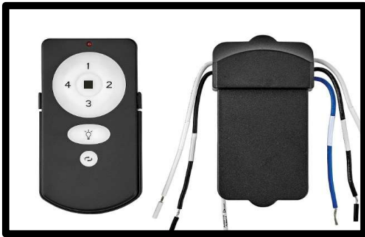
980002FBK-xxx Accessory w/WiFi